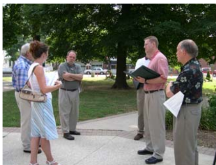
Members of CCCDC, Main Street and Chamber of Commerce tour City of LaGrange